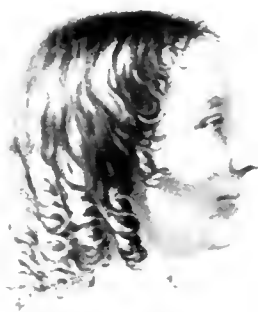
ANNA CORA MOWATT RITCHIE.